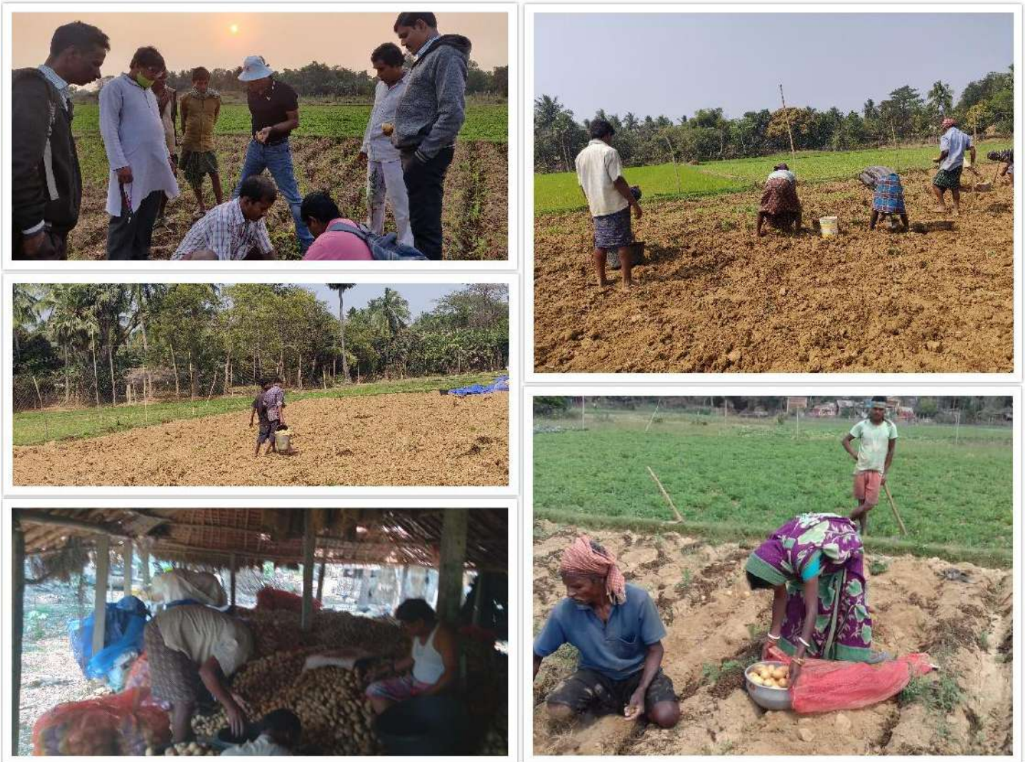
Pic 10 – YV provides Technical, Material, and Marketing support for various farming units based on mixed agriculture, Horticulture, Pisciculture, Apiculture, etc.

The YVF develops the mechanisms of financial sustainability through the formation of village development funds, corpus funds, and maintenance funds. The idea is to make rural people more productive with innovative methods (through skill training) and provide them an opportunity for supplementary income to improve their quality of life.