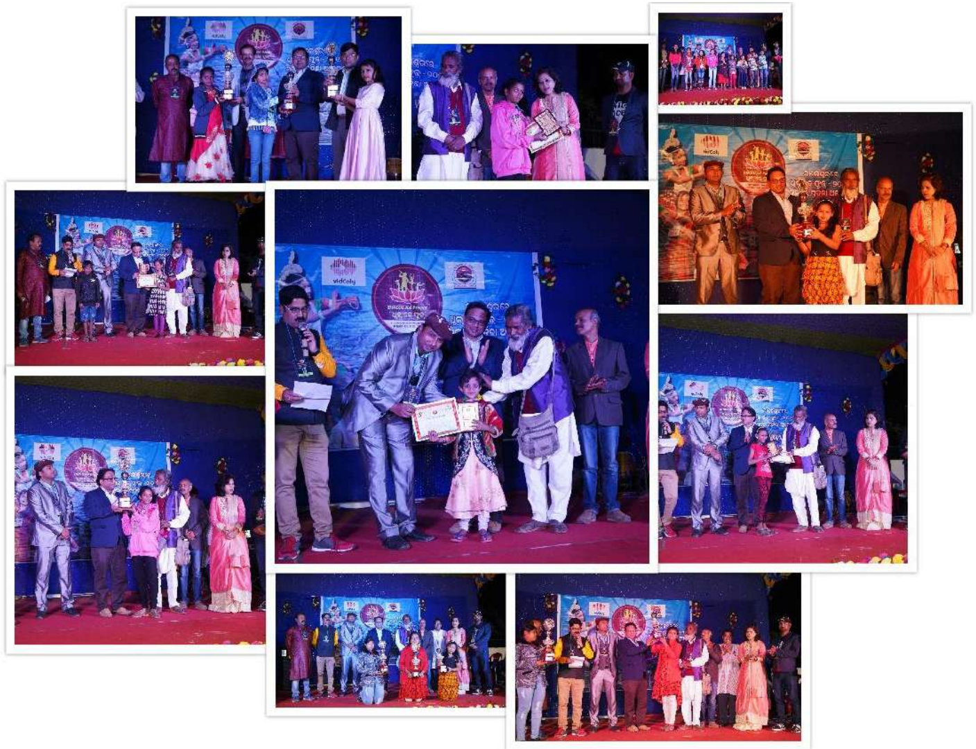
Pic 7–DhoolKePhool – Prize Ceremony: The high participation of talented kids shows that there is a great need to work in this area