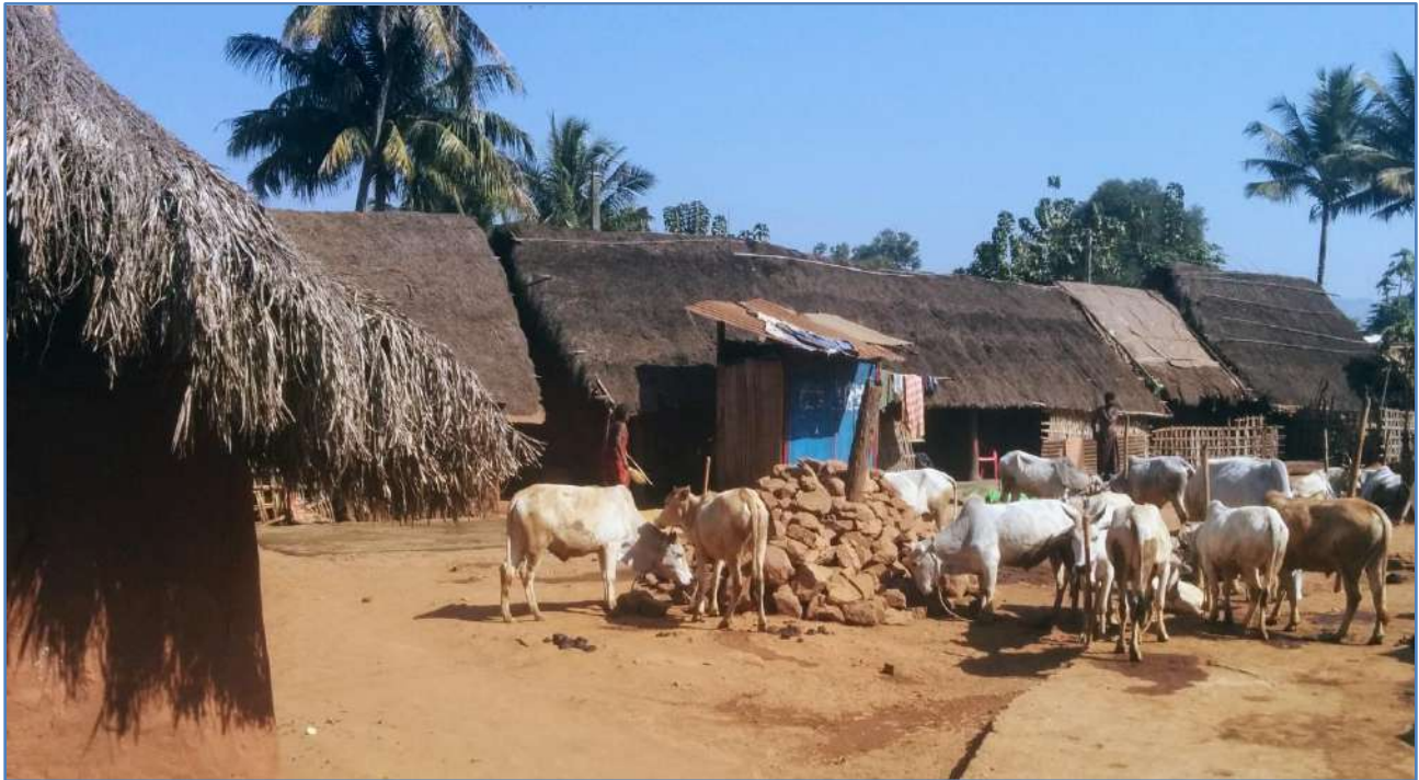
Pic 3 –YuvaVikas Foundation believes in the Propagation of Organic Farming, Bio-fertilizer &Vermicompost

Social environments emerge from the interaction between biophysical ecology and human interventions. This is a two-way process. Just as nature shapes society, society shapes nature. For instance, the fertile soil of the Indo-Gangetic floodplain enables intensive agriculture. Human interventions increasingly have the power to alter environments, often permanently.