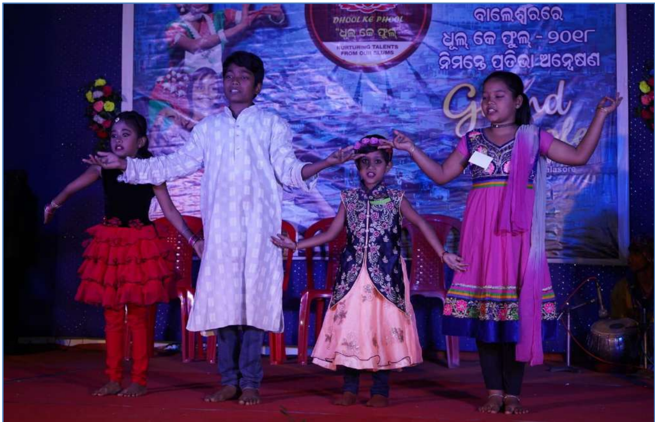
Pic 5–A snap from DhoolKePhool – It is organized by the YVF.

Modern education thinkers believe that physical development supports mental and cognitive development in young children. The capacity to think, reason, and make sense of the self and the world and use language is intimately connected with interacting as a team player and playing the moves strategically. It is required to foster curiosity, creativity, and imagination in the young minds of rural India.