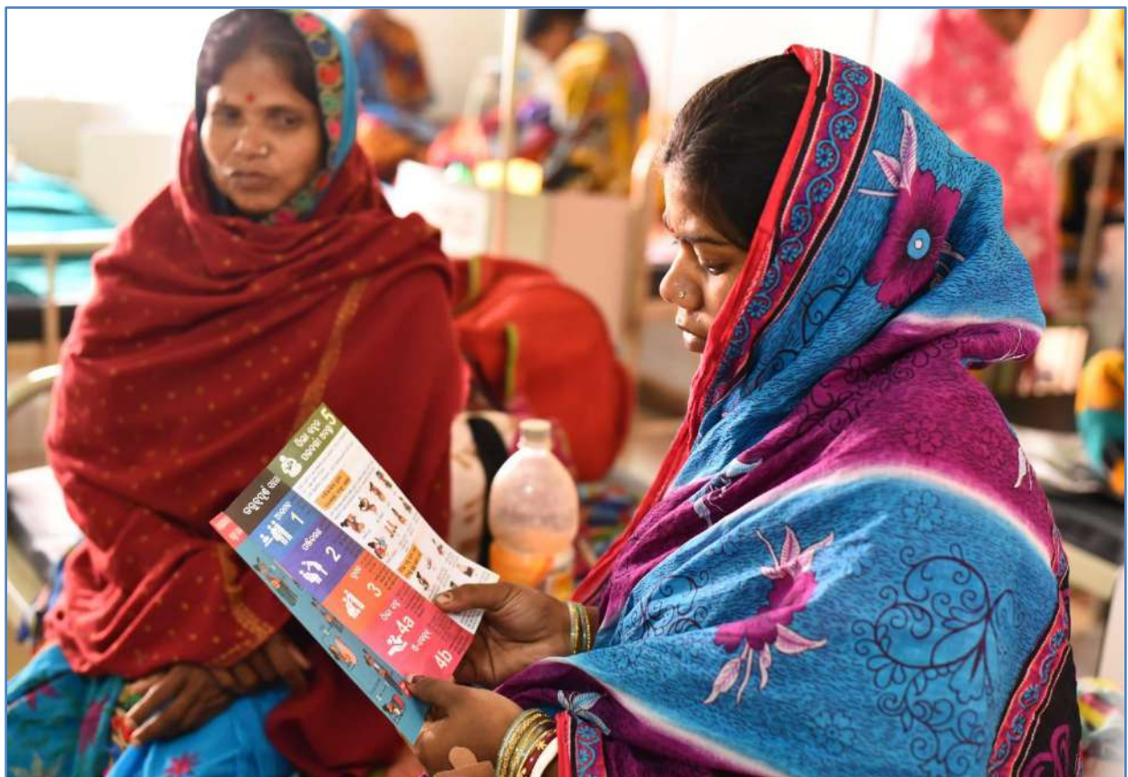
Pic 2–YVF empowers local women with functional Literacy