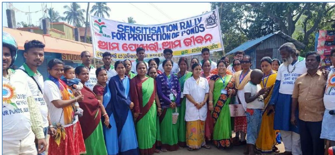
Pic 4 - YV is working to Strengthen People's voices to Save Nature: Eco-friendly, sustainable, participatory, farm-based Integrated Rural Development and Empowerment of People are the key to Sustainable Development and true Democracy