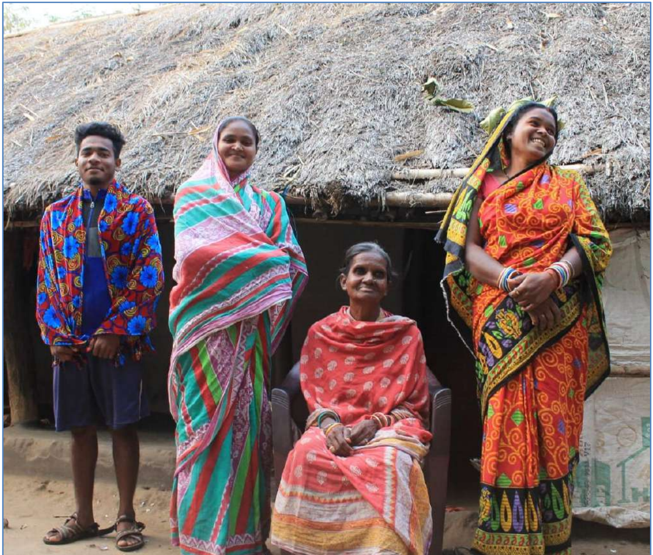
Pic8 – Many of the YV villages are isolated places, extremely backward areas, without any road connection and proper electricity supply

With the 73rd Amendment to the Constitution in 1992, the Government of India has provided immense autonomy to villages through the Panchayati Raj System. With this change, states are obliged to support village democracy by organizing village panchayats and endowing them with the requisite powers and authority to enable them to function as local self-government. Panchayati Raj now functions as a system of governance in which gram panchayats are the basic units of local administration with executive powers being vested in Mukhiya, Sarpanch, and other village level functionaries.