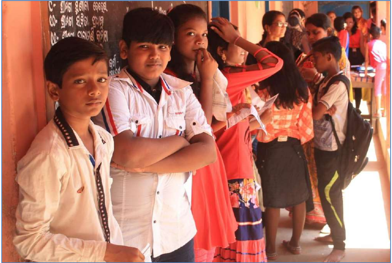
Pic 6–DhoolKePhool – Audition

This project aims to support high-quality performers from slums and poor families through a workspace supported by field professionals for cultivating Grassroots talents. Young children will get a chance to work with specialists to understand the concepts and improve themselves.