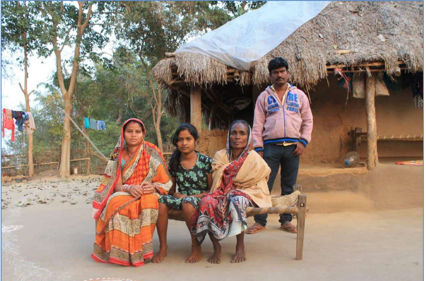
Pic 11–A snap from YVF village - YV is Strengthening Tribal Communities in Rural-Odisha

YuvaVikas Foundation approaches habitat development with a community focus wherein all the families irrespective of caste and class are involved in the project. This allows for the entire habitation members to plan and implement programs based on their priorities.