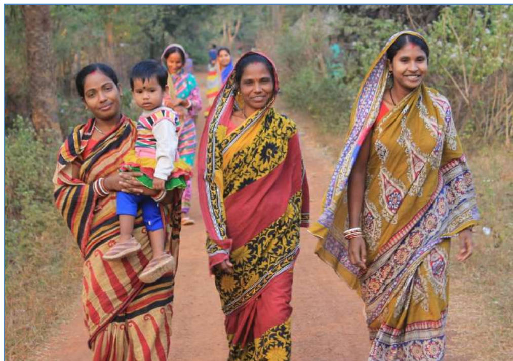
Pic 1 – Women groups have a key impact on the socio-economic development of rural regions

Development projects, to reach rural India, need the right people and the right strategy. There is a big gap in the right conceptualization and right method of implementation. Again there is a need for providing professional services as a one-stop solution for early-stage entrepreneurs in social impact-based enterprises.